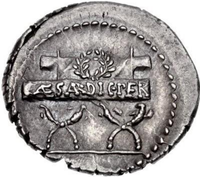
4 - coin with curule chair with laurel wreath "CAESAR DIC PER"

elections proposed for consuls the tribunes previously mentioned, and they not only privately approached Marcus Brutus and such other persons as were proud-spirited and attempted to persuade them, but also tried to incite them to action publicly.