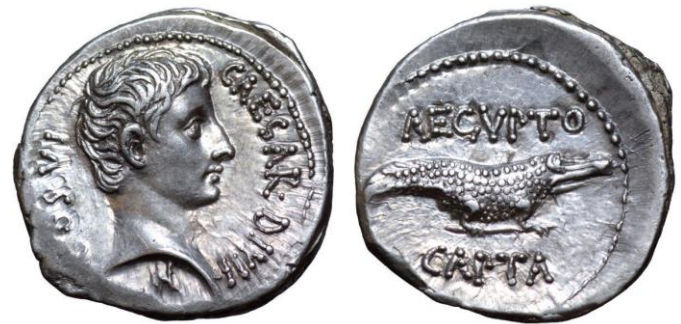
7 - Augustus 'Son of a God'; 'Egypt Defeated' with a crocodile

Augustus turned the kingdom of Egypt into a Roman province; and then, to increase its fertility and its yield of grain for the Roman market, set troops to clean out the irrigation canals of the Nile Delta which had silted up after many years' neglect. To perpetuate the glory of his victory at Actium, he founded a city close to the scene of the battle and named it Nicopolis — or 'City of Victory' — and made arrangements for the celebration of Games there every five years. He also enlarged an ancient local temple of Apollo, and embellished his camp with trophies taken from Antony's fleet, consecrating the site jointly to Neptune and Mars.