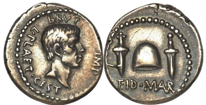
5 - A coin struck by Brutus after the assassination EID MAR = ides of March

20 1 A great outcry naturally arose from all the rest who were inside and also from those who were standing near by outside, both at the suddenness of the calamity and because they did not know who the assassins were, their numbers, or their purpose; and all were excited, believing themselves in danger. 2 So they not only turned to flight themselves, every man as best he could, but they also alarmed those who met them by saying nothing intelligible, but merely shouting out the words: "Run! bolt doors! bolt doors!" 3 Then all the rest, severally taking up the cry one from another, kept shouting these words, filled the city with lamentations, and burst into the workshops and houses to hide themselves, even though the assassins hurried just as they were to the Forum, urging them both by their gestures and their shouts not to be afraid.