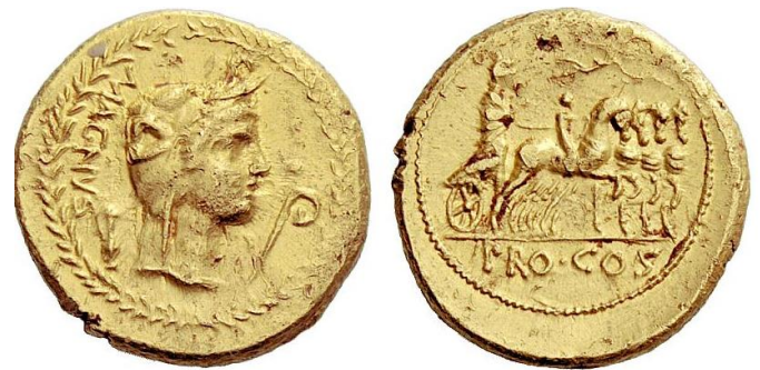
3 - MAGNUS / PRO COS; head of Africa and Pompey riding in Triumph