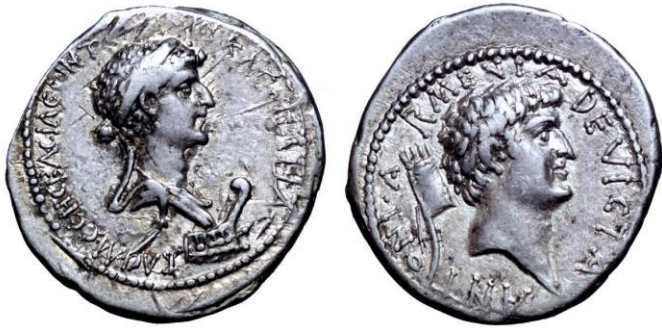
6 - a coin used to pay Antony's Roman soldier: Cleopatra and a ship prow; Antony and a regal Armenian tiara

17. Eventually Augustus broke his friendship with Mark Antony, which had always been a tenuous one and in continuous need of patching; and proved that his rival had failed to conduct himself as befitted a Roman citizen, by ordering the will he had deposited at Rome to be opened and publicly read. It listed among Antony's heirs the illegitimate children fathered by him on Cleopatra. Nevertheless, when the Senate outlawed Antony, Augustus allowed all his relatives and friends to join him under safe conduct, including Gaius Sosius and Titus Domitius, the Consuls of the year. He also excused Bologna, a city traditionally dependent on the Antonian family, from rallying to his side as the rest of Italy was doing. Presently he defeated Antony in a sea-battle off Actium, where the fighting went on so long that he spent the whole night aboard his flagship.