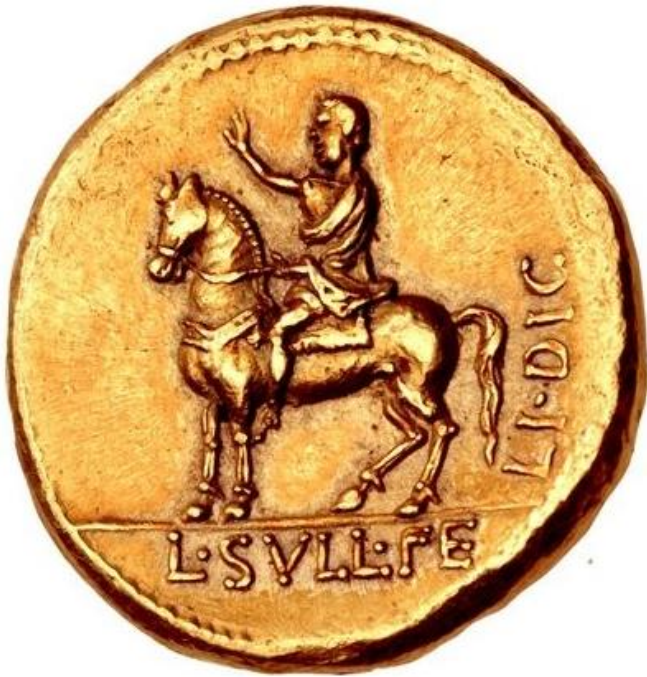
2 - L. Sull(a) Feli(x) Dic(tator) from 80 BCE

He increased the number of priests and reduced the power of the tribunes. When the republic had been set in order, he lay down his dictatorship; and then he retired and withdrew to Puteoli, where he died from a sickness called phthiriasis.