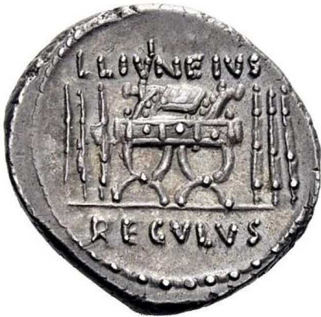
1 - coin with image of curule chair and six fasces

he decreed that no one should go to Decius to obtain justice. As consul, he defeated the Ligurians and the Taurisci and celebrated a triumph over them. As censor, he constructed the Aemilian Way and built the Mulvian Bridge. His authority was so great that Opimius took up arms against Gracchus, and Marius against Glaucia and Saturninus, because of Scaurus' advice in private. He forbade his own son to come into his presence because he had deserted his post; because of this shame, the son killed himself. In his old age, Scaurus was accused by Varius, the plebian tribune, of supposedly compelling their allies and Latium to take up arms. Scaurus made this reply to the people: "Varius of Verona says that Aemilius Scaurus forced the allies to arms. Scaurus denies it. Which one do you think should be believed?"